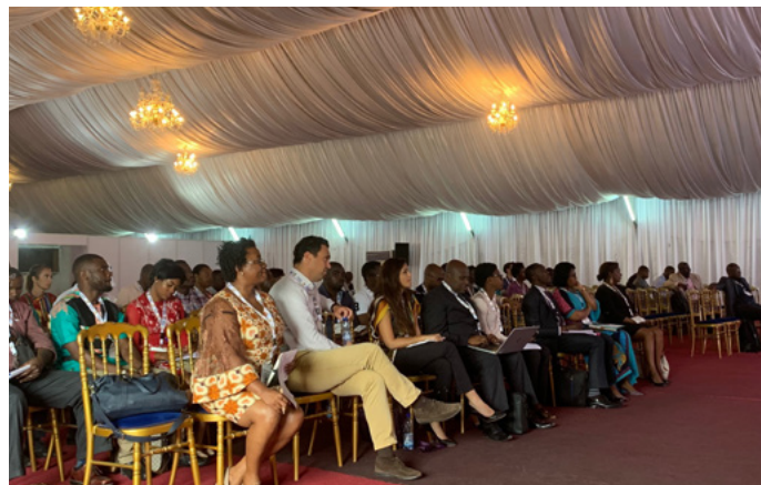
Seminar at the Gabon Wood Show